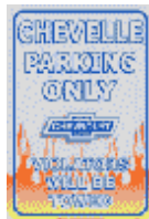
Tin Sign: Chevy Chevelle Parking Only Sign T720 MSRP $12.95