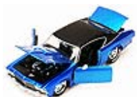
Jada Toys Bigtime Muscle - Chevy Chevelle SS Hard Top (1969, 1:24, Asstd.) 90213PD