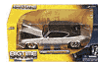
Jada Toys Bigtime Muscle - Chevy Chevelle SS Hard Top (1969, 1:24, Asstd.) 90340PD