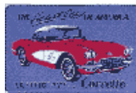
Tin Sign: Chevy Heart Beat Corvette sign T192 MSRP $12.95