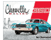
Tin Sign: Chevy Chevelle Malibu 350 Sign TD1491