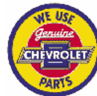
Tin Sign: Chevy Genuine Parts sign TD1072 MSRP $12.95