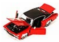
Jada Toys Bigtime Muscle - Chevy Chevelle SS Hard Top (1969, 1:24, Asstd.) 90213KE