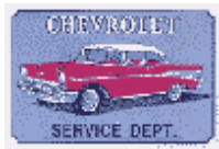
Tin Sign: Chevrolet Service Department sign T6