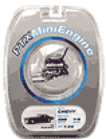
PTX Mini Engine - Chevy V8 Big Block Engine (1:24, Red) 28004M