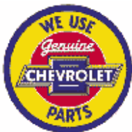
Tin Sign: Chevy Genuine Parts sign TD1072