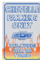
Tin Sign: Chevy Chevelle Parking Only Sign T720