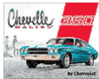
Tin Sign: Chevy Chevelle Malibu 350 Sign TD1491 MSRP $12.95