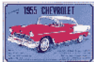
Tin Sign: 1955 Chevy sign T66 MSRP $12.95