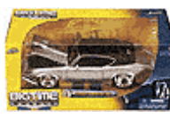
Jada Toys Bigtime Muscle - Chevy Chevelle SS Hard Top (1969, 1:24, Asstd.) 90340KE